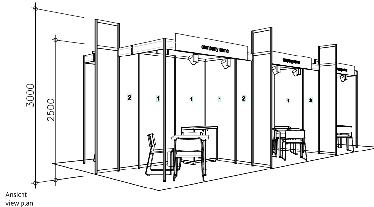
Ansicht view plan